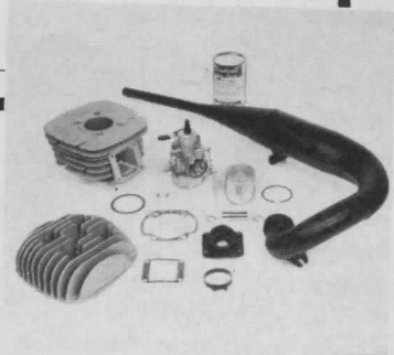
The Noguchi "Factory Works" Kit For the Yamaha MX 125.

Chromed Alloy Cylinder Alloy Cylinder Head Head Gasket Cylinder Gasket Piston w/pin and clips Piston Ring Large Volume Carb Manifold Reed Valve Gasket Mikuni 28mm Aluminum Carb Carb Clamp High Pipe or Low Pipe Main Jets (2) BLENDZALL Racing Castor