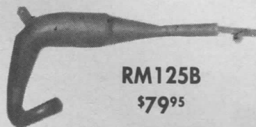
RM125B $79 95

If you're serious about your racing and you want that extra advantage over the competition then LOP is where you'll get it! Our racing exhaust pipes are thoroughly tested and designed to give you maximum power throughout the entire R.P.M. range.