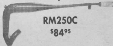
RM250C $84 95